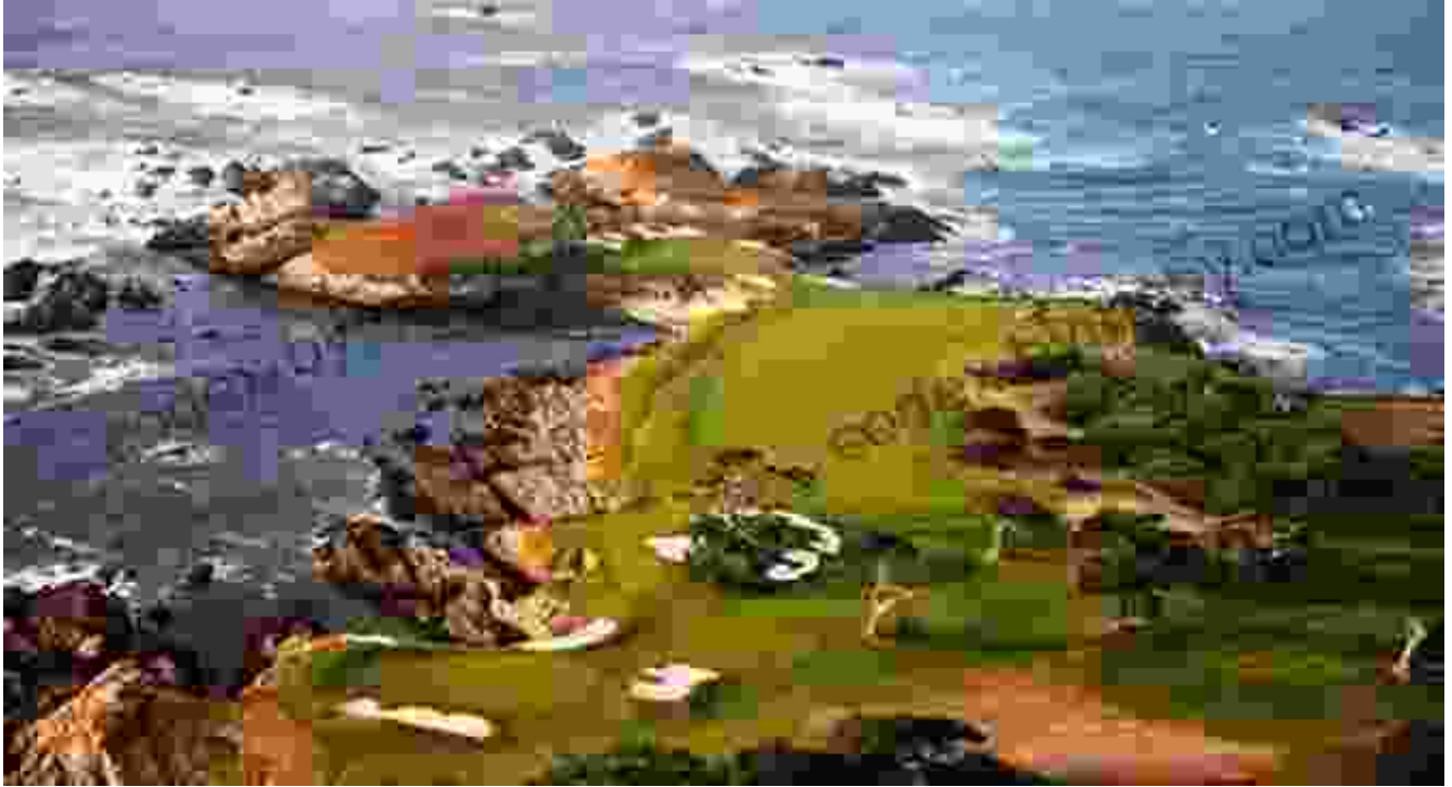
Cypress Point, a Coastal Paradise

Overlooking the picturesque Monterey Bay, Cypress Point is a golf course that will leave you breathless. Its stunning scenery, challenging holes, and rich history make it a must-play for any golf enthusiast.