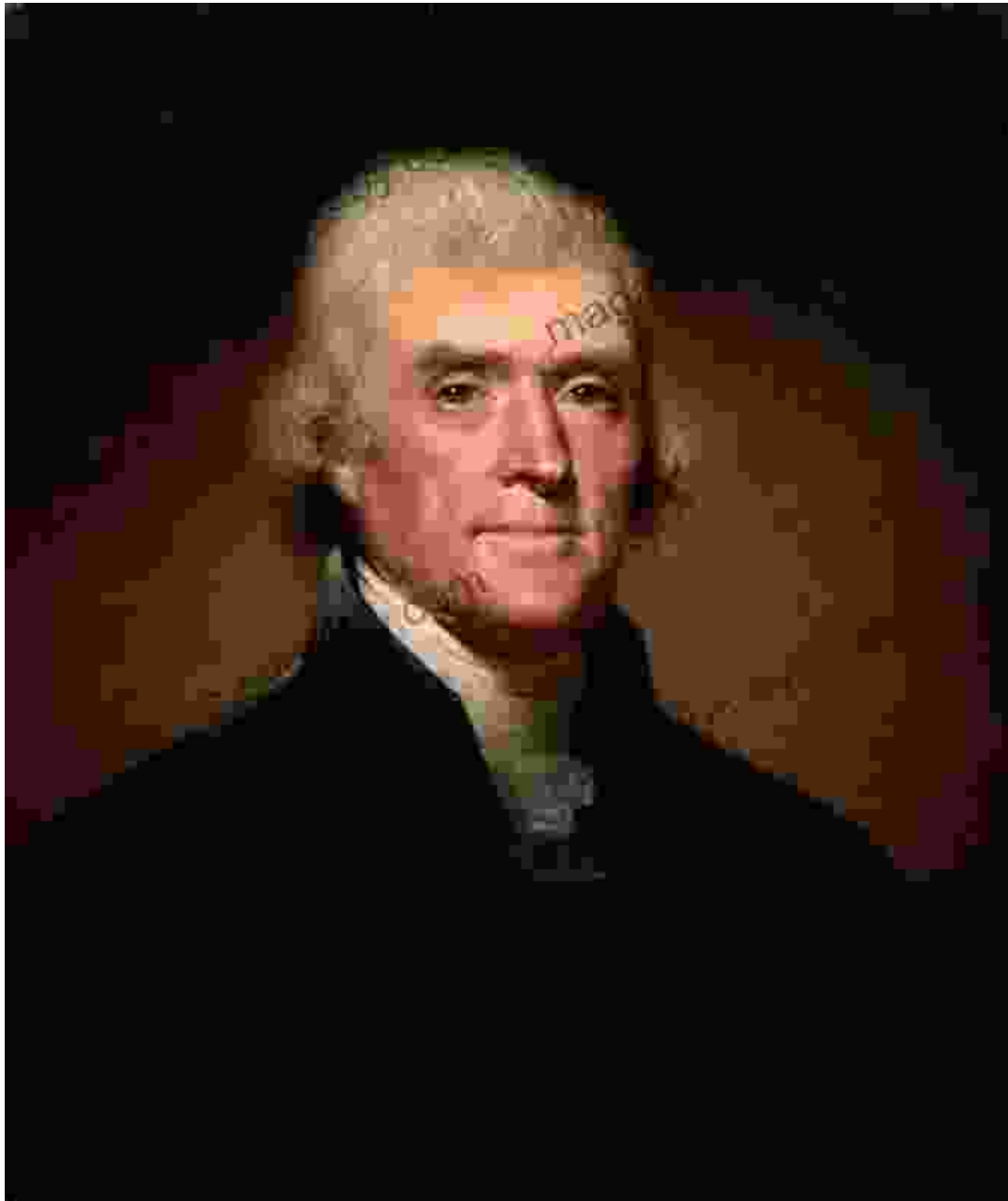
From Lawyer to Statesman