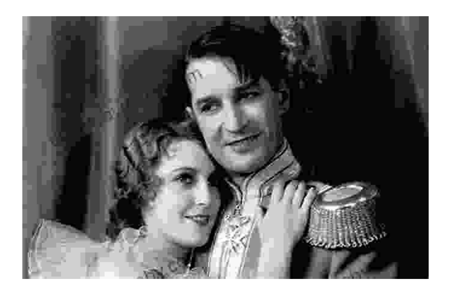
The Love Parade's impact on electronic music and culture is undeniable.

Parade remains a symbol of Berlin's transformation from a divided city to a global cultural hub.