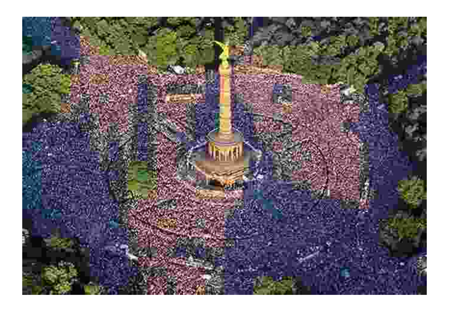
The Love Parade's commercialization led to criticism that it had lost its original spirit.

The commodification of the Love Parade raised important questions about the intersection of art and commerce. While commercialization provided financial stability and global recognition, it also threatened to compromise the festival's authenticity and detract from its core message of love and unity.