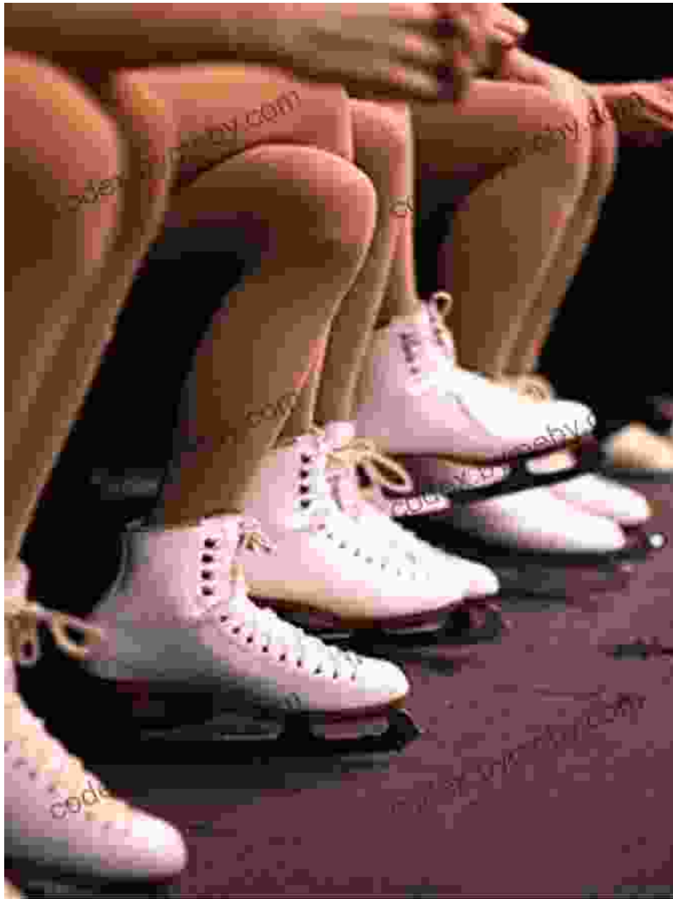
Figure skating has a rich and enduring legacy that continues to inspire generations of athletes and captivate audiences worldwide. Its timeless appeal lies in its ability to showcase human potential, artistry, and the pursuit of excellence.