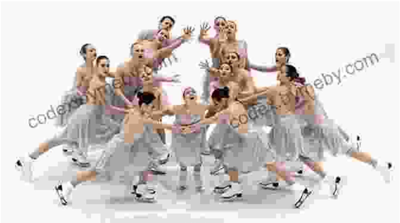
Figure skating fosters a strong sense of community and camaraderie among its participants.

Beyond the competitive arena, figure skating nurtures a vibrant and supportive community. Skaters from all walks of life come together to share their passion for the sport. They form bonds of friendship and support,