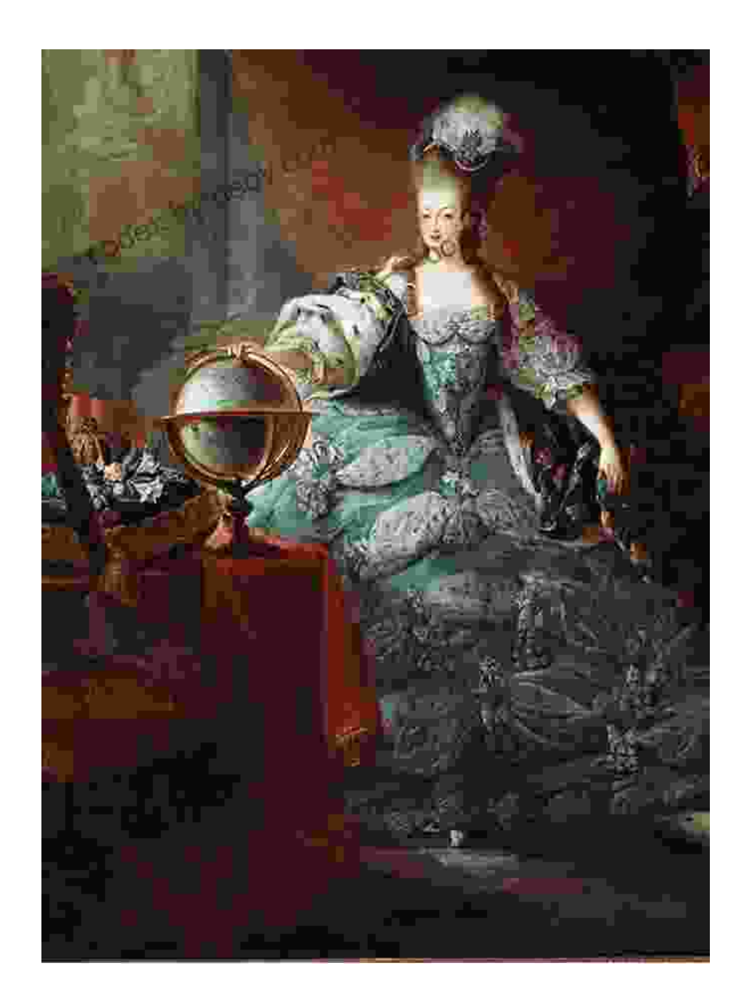
A Tapestry of Extravagance and Excess