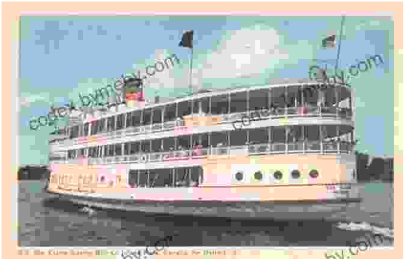
Boblo Island on its closing day in 1993, after 95 years of operation.