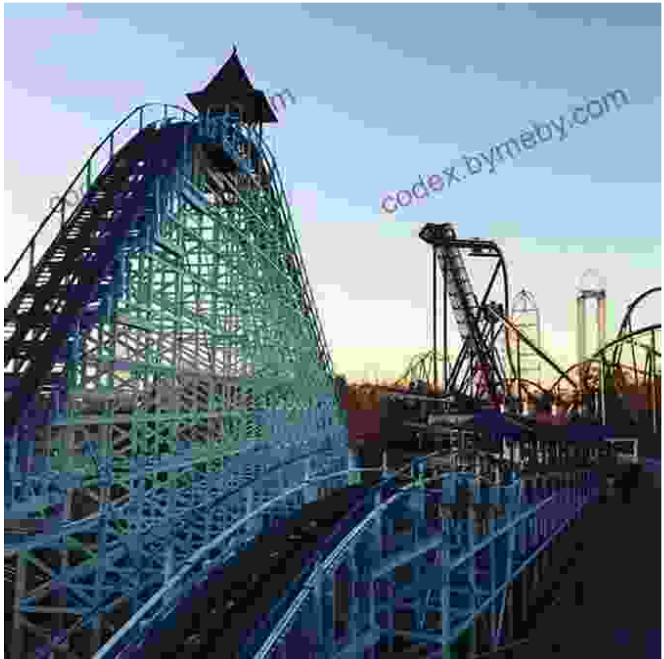
The Blue Streak roller coaster, one of Boblo Island's most popular attractions.