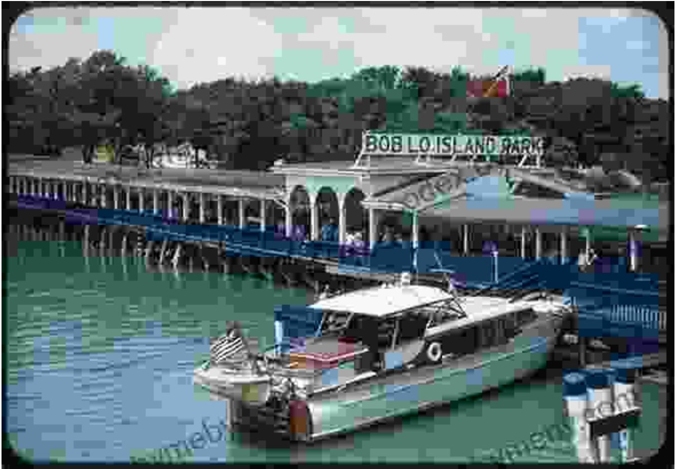
Boblo Island in the 1950s, at the height of its popularity.