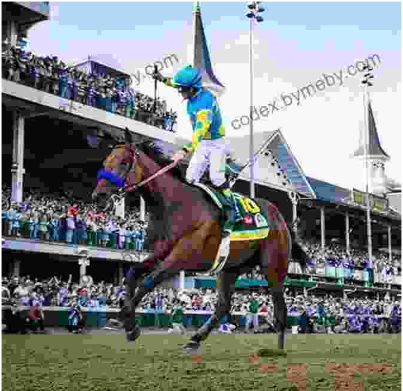
Image 2: American Pharoah winning the Preakness Stakes