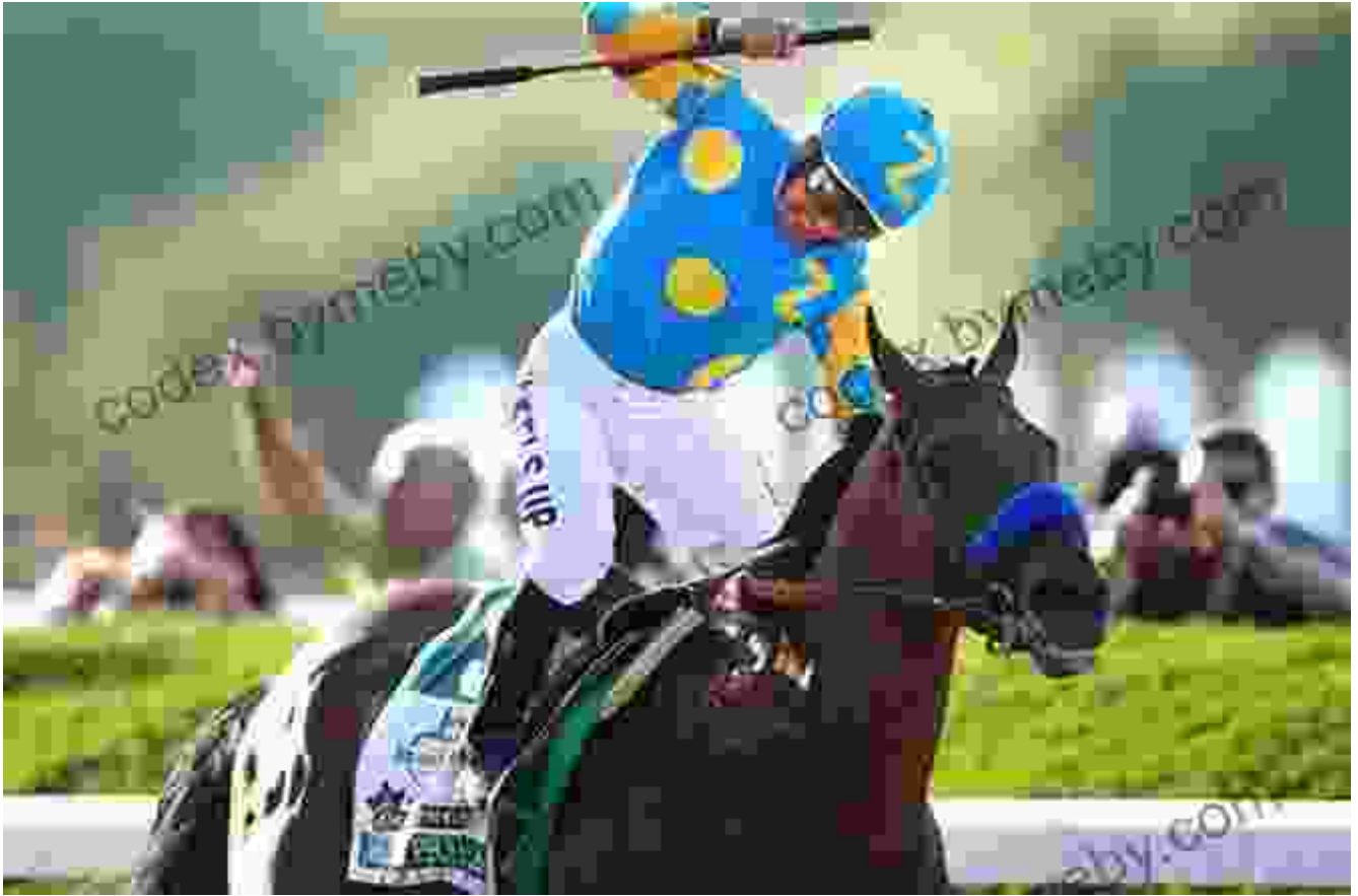
American Pharoah winning the Preakness Stakes

Image 3: American Pharoah winning the Belmont Stakes